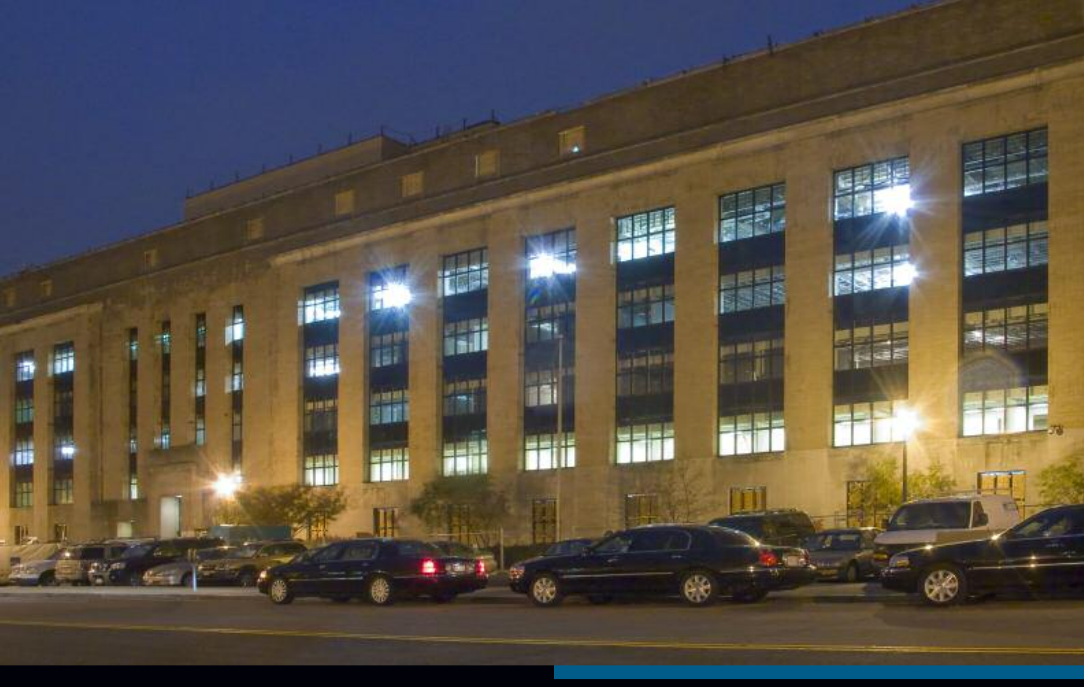
Hope's® Liberty Series™ Blast Resistant Windows Historically Accurate Rehabilitation of the Mary E. Switzer Building